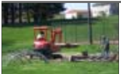
Work Begins at Minch Park